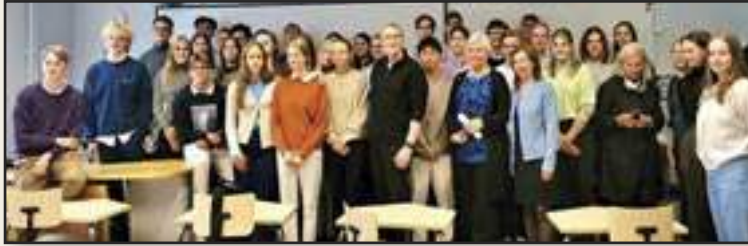
Students at Reaalkool learning about Suur põgenemine