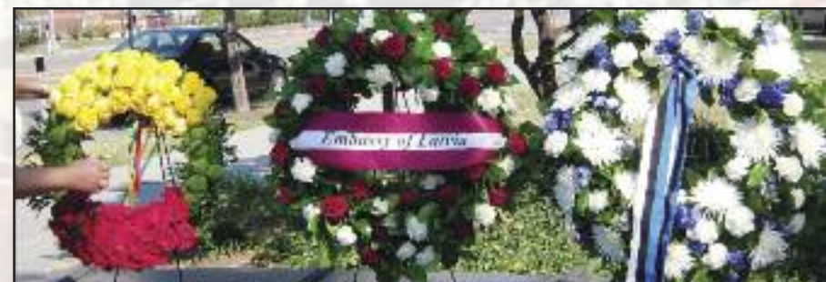
Black Ribbon Day at Victims of Communism Memorial, Washington DC, August 23, 2015