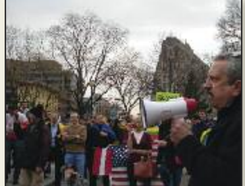
Estonians demonstrate at Ukrainian rallies in Washington.

Nüüd, rohkem kui kunagi varem, on ERKÜ töö poliitilises valdkonnas kriitiline. ERKÜ toetab Joint Baltic American National Committee (JBANC) ja töötab aktiivselt, et informeerida Ameerika poliitikuid Ameerika eestlastele muret-tekitavatest küsimustest. Meie kohtume Välisministeeriumiga, Kongressi liikmetega ja nende staabiga, ja hoiame sidet Eesti ja teiste riikide saatkondadega. Lisa raha võimaldab meil liikuda vabatahtlikust tööjõust järjekindlamale ja täisajalisele alusele.