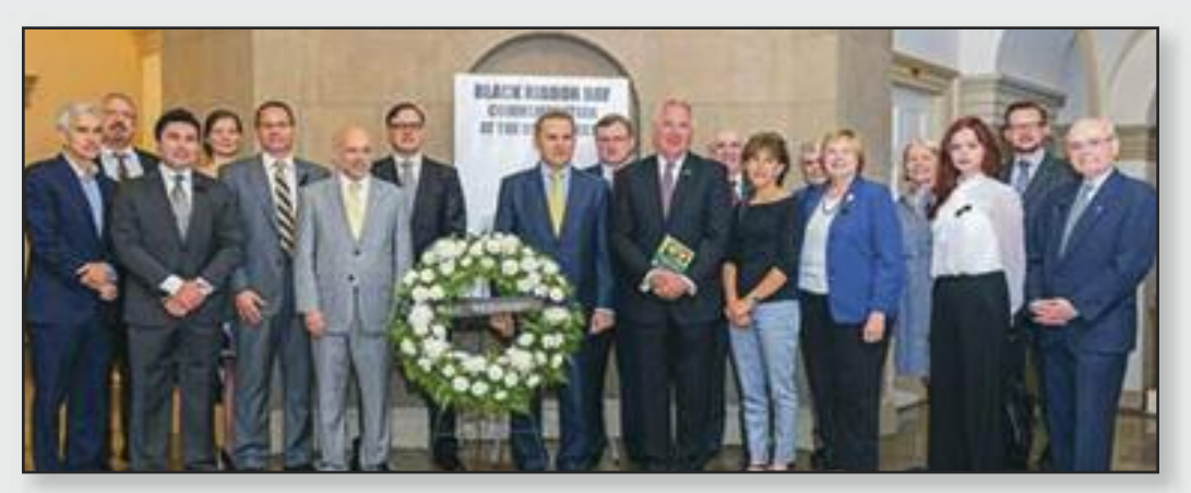
First Black Ribbon Day commemoration in the U.S. Capitol with Congressman John Shimkus and Baltic diplomats and representatives.

Of the 33 Senate seats that were contested, seven were open (no incumbent). In 2012, Democrats won 25 of the 33 seats. This year, the Republicans won 22 seats (13 holds and nine pick-ups), while Democrats held on to eleven. Out of those 33 races, there were a number of key supporters of the Baltics, and certainly none more so than Senator Richard Durbin (D-IL), who easily held onto his seat.